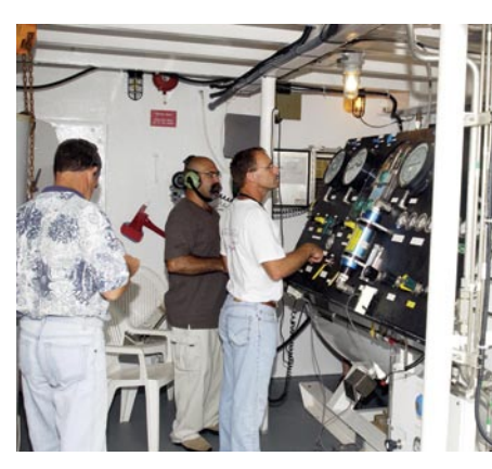
A dive medical technician on the Freedom Star monitors a recompression chamber to help a lobster diver who suffered distress after a dive off Cape Canaveral.