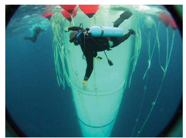
(Top left & right) The ship locates the booster, divers separate the chutes; (left) the ship retrieves the chutes.