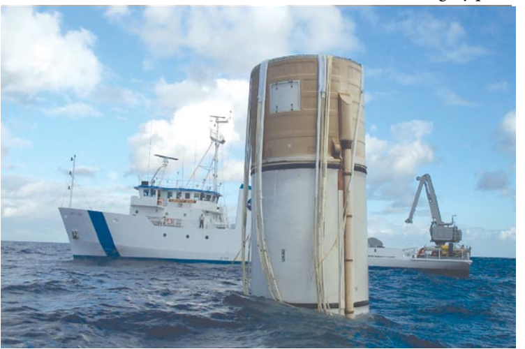
A retrieval ship arrives at a half-submerged solid rocket booster after a shuttle launch. Divers will prepare the booster under water to float horizontally and be towed back to Port Canaveral.

The ships are propelled by two main engines