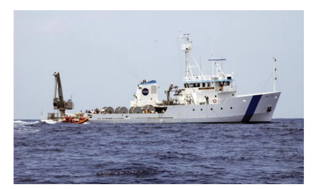
The Liberty Star on the Oculina Banks, helping researchers who wanted to characterize the condition of the deep-sea coral reefs and reef fish populations on the banks, located 20 miles offshore of the east coast of Florida..