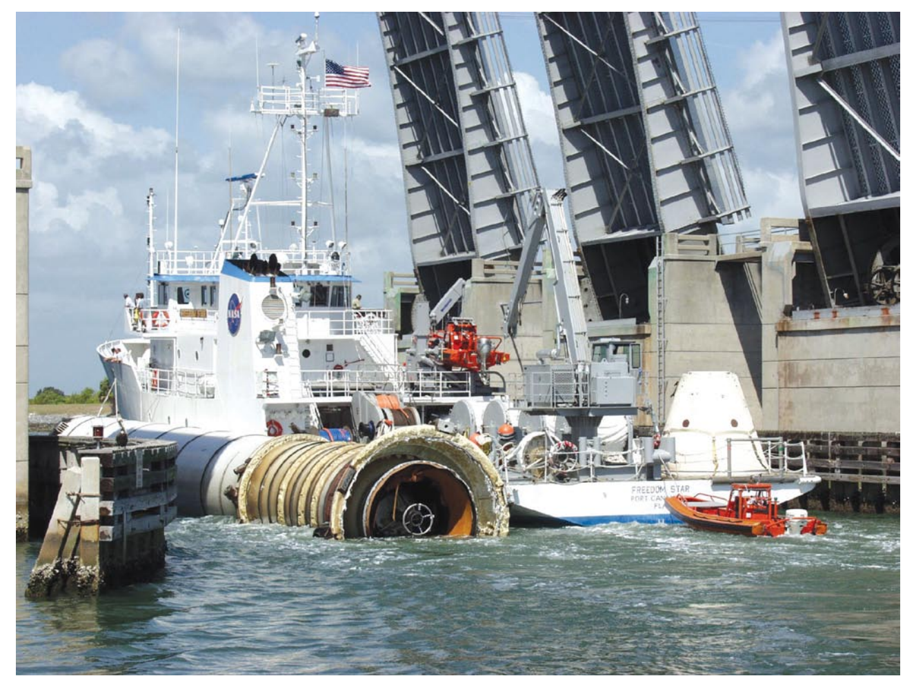
With the booster now alongside in the hip tow position, the ship passes through a drawbridge and Canaveral Lock to the Banana River on its way to Hangar AF.