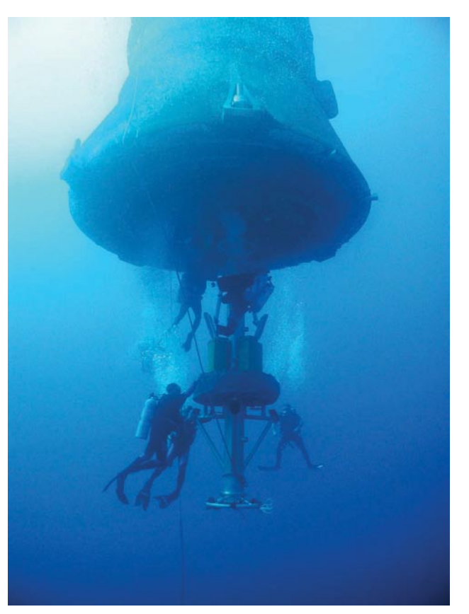
(Above) Divers insert an Enhanced Diver-Operated Plug into the booster nozzle, displacing the water and causing the booster to assume a semi-log or horizontal position.

(Above left) The drogue chute is wound onto a reel on deck.