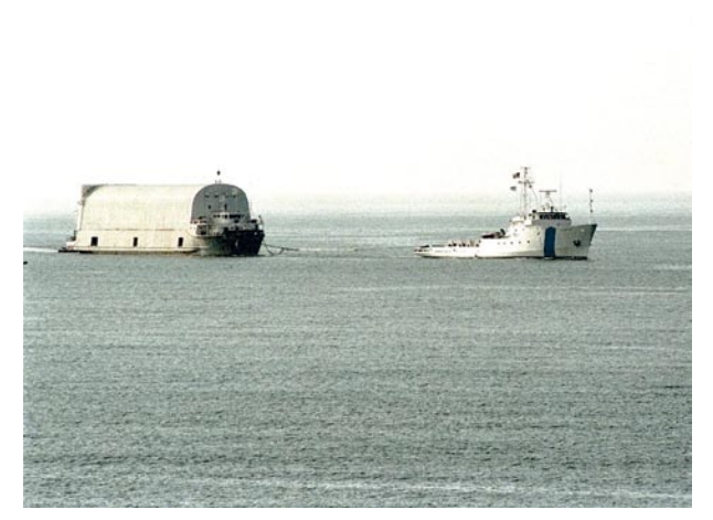
Freedom Star tows a barge with an external tank into Port Canaveral for the first time.

In the fall of 2002 and the spring of 2003, both Liberty Star and Freedom Star supported a National Oceanic and Atmospheric Administration-sponsored undersea expedition. The mission was to characterize the condition