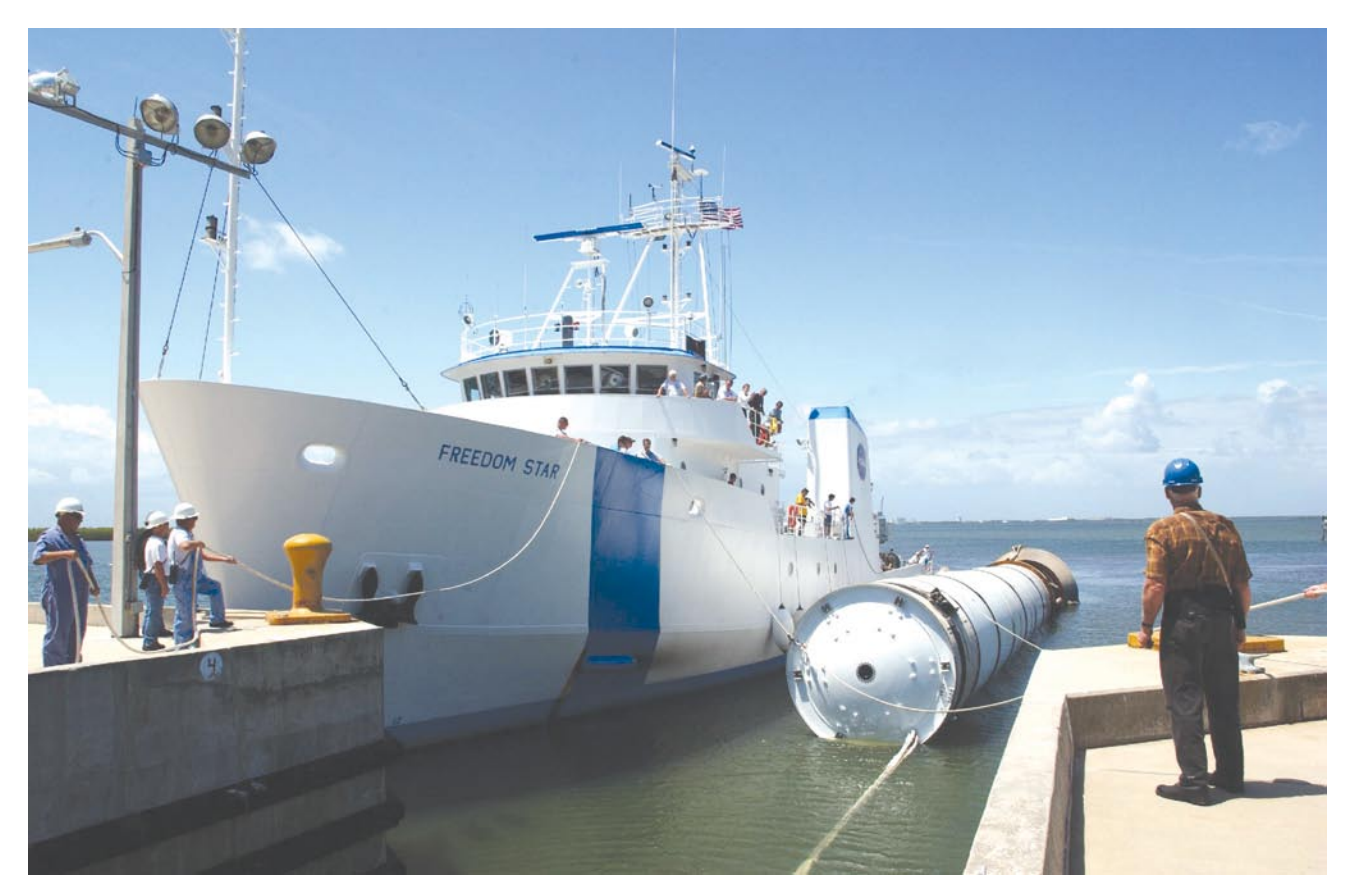
At Hangar AF, the booster is released from the ship. It will be towed to a position where Straddle-Lift cranes can lift it from the water and place it on a rail car for disassembly.

The ships are well-suited for their role in supporting space shuttle operations. Liberty Star and Freedom Star also have proven themselves in other actions. Both vessels have seen service in side-scan sonar exercises, cable-laying,