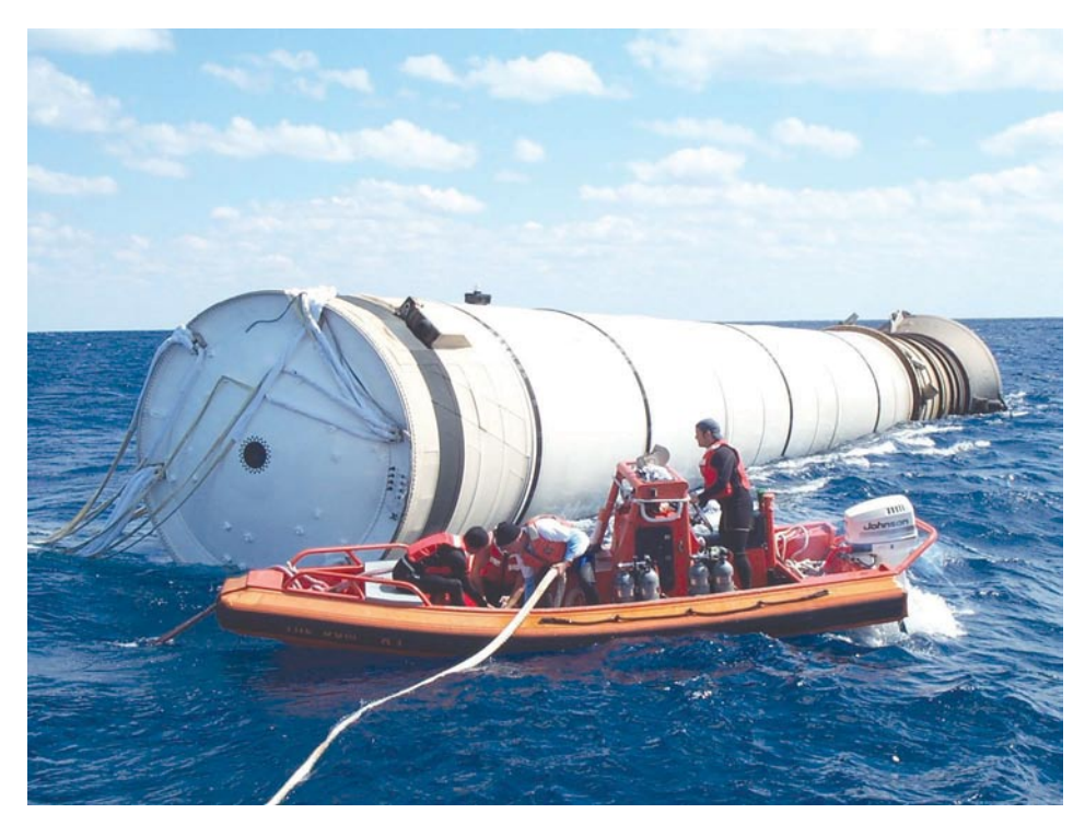
(Left) Divers attach tow lines to the floating booster.